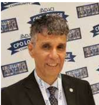
President of ADACI and CEO of ADACI Formanagement Srl